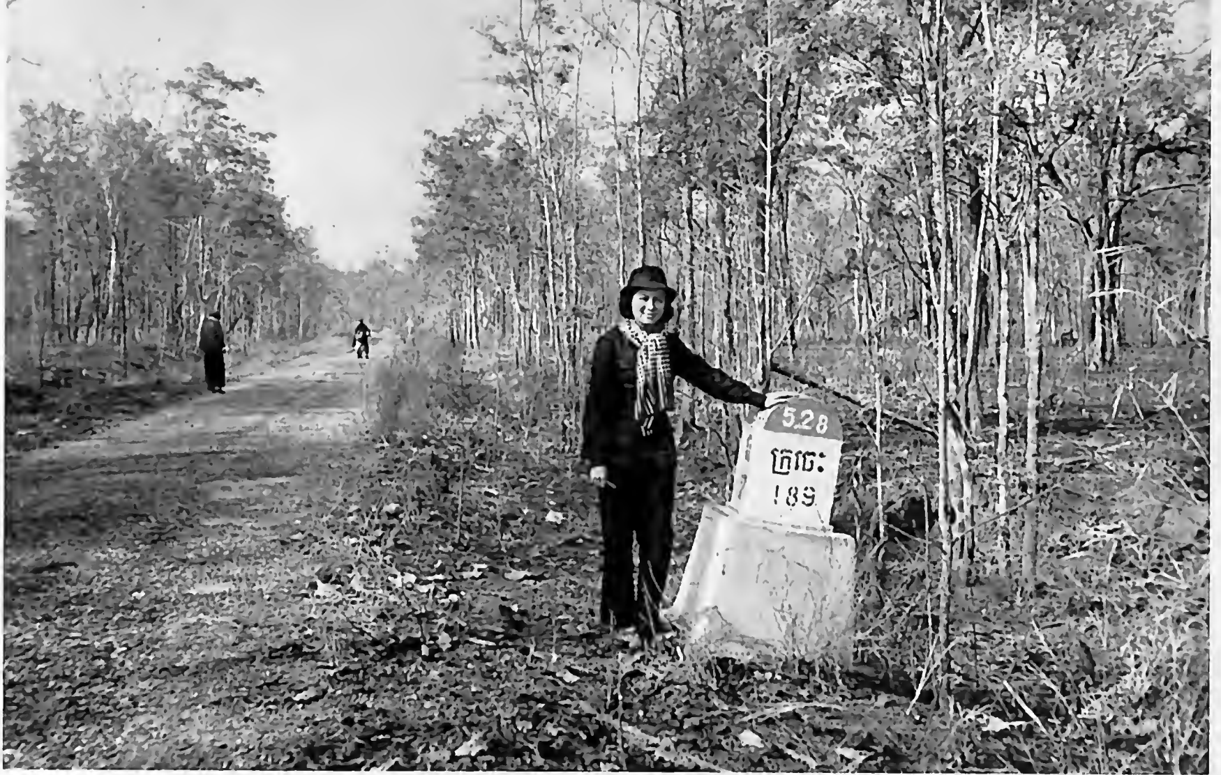
On the Stung Treng-Kratie-Phnom Penh state highway. The milestone reads: Kratie: 189 kms.